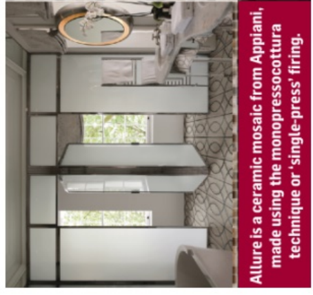
Allure is a ceramic mosaic from Appiani, made using the monopressocottura technique or 'single-press' firing.